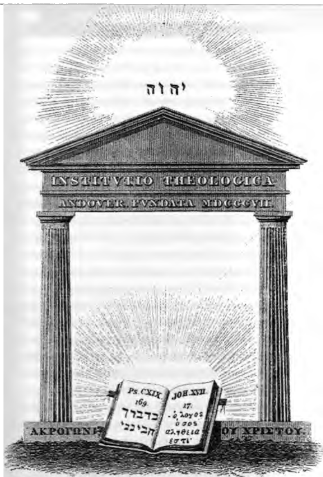
ANDOVER-HARVARD THEOLOGICAL LIBRARY MDCCCX CAMBRIDGE, MASSACHUSETTS